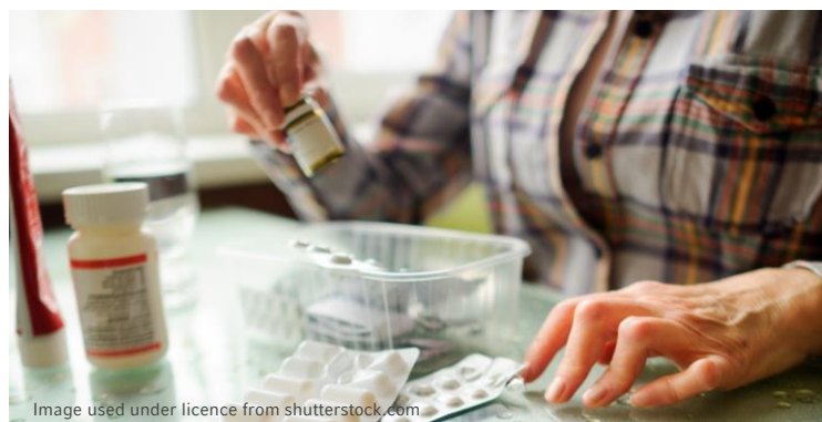
Figure 2: RA patient with hand deformities

In general, RA occurs in a ‘symmetrical’ mirror pattern. That means, for instance, that if one hand is affected the other hand is typically affected, too. Often, symptoms are worse following a longer period of inactivity, e.g. after awakening in the morning; this ‘morning stiffness’, which can last for more than an hour, is a typical feature in RA patients.